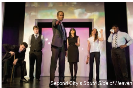
Second City's South Side of Heaven

Happy Earth Day! Enjoy an Earth Day benefit that includes wine, appetizers, dinner, an auction and performances by live bands and DJs at Earth, Wine and Fire . Peggy Notebaert Nature Museum, 2430 N. Cannon Drive from 6:30 - 11 p.m. $25-$35 For more info: www.earthwineandfire.com